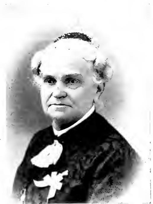
ELIZA DANIEL STEWART.

soldiers had conquered by force of arms. The subject of woman's enfranchisement early claimed her attention and received her full endorsement. Removing to Springfield, Ohio, her present home, she continued to agitate those subjects from the platform and with her ever vigorous pen. She organized and was made president of the first woman suffrage association formed in her city. On 22nd January, 1872, she delivered a lecture on temperance, in Springfield, which was her first step in the "Crusade" movement. Two days later a drunkard's wife prosecuted a saloon-keeper under the Adair Law, and Mother Stewart, going into the court-room, was persuaded by the attorney to make the opening plea to the jury, and to the consternation of the liquor fraternity, for it was a test case, she won the suit. It created a sensation, and the press sent the news over the country. Thereafter she was known to the drunkards' wives, if not as an attorney, at least as a true friend and sympa-